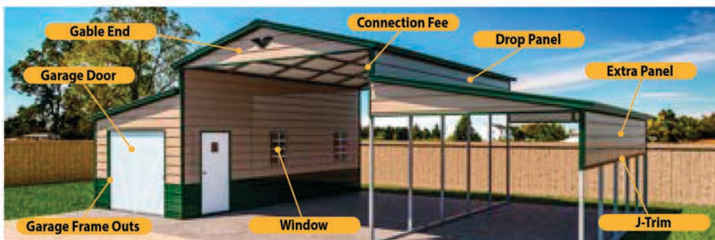
Example shown features additional options not included in base price.