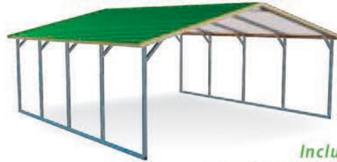
Includes 6" overhang on all sides