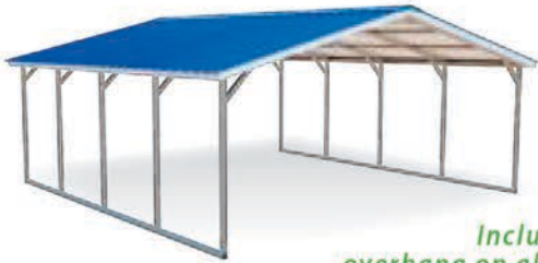
Includes 6" overhang on all sides