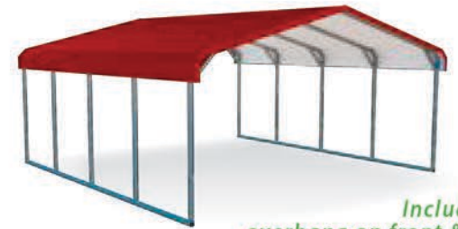
Includes 6" overhang on front & back